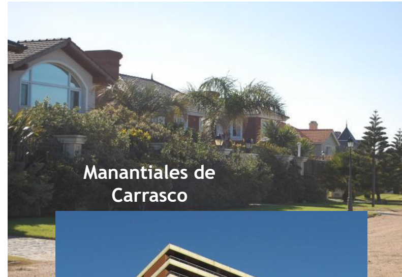
Manantiales de Carrasco